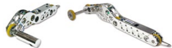
Prop II Meter ▲ F-Speed Reader