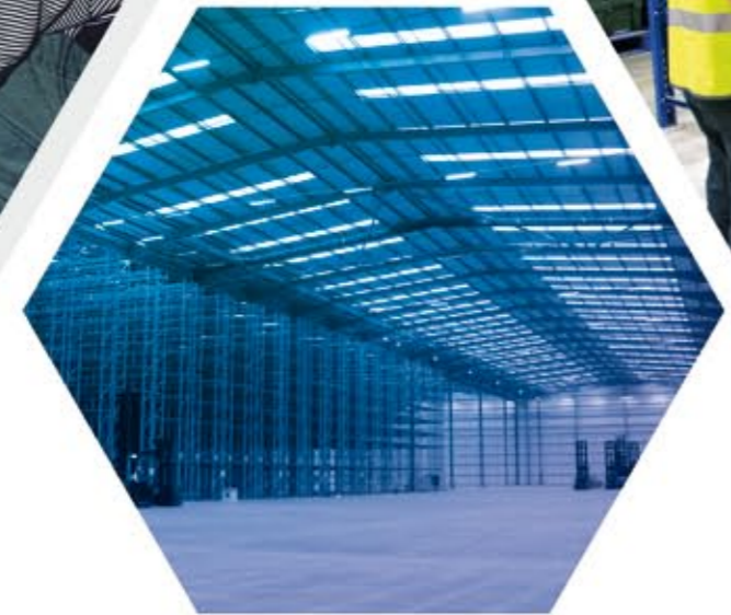
H - Height of racking in metres