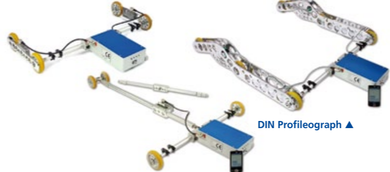
DIN Profilegraph ▲